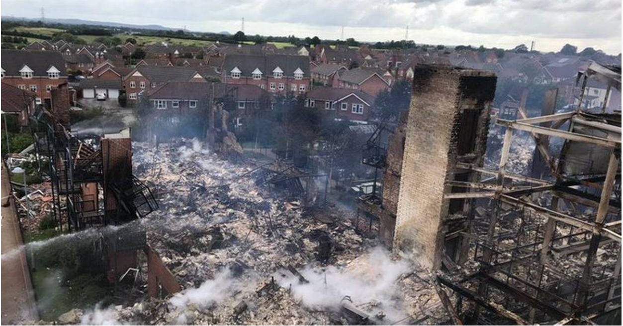
In August 2019, the homes and belongings of 150 older people were lost when Beechmere, a residential complex in Crewe was destroyed in a huge fire. Wedding rings, old family photos and even the ashes of a late husband were among the treasured possessions reported to have been lost. Beechmere opened in 2009.